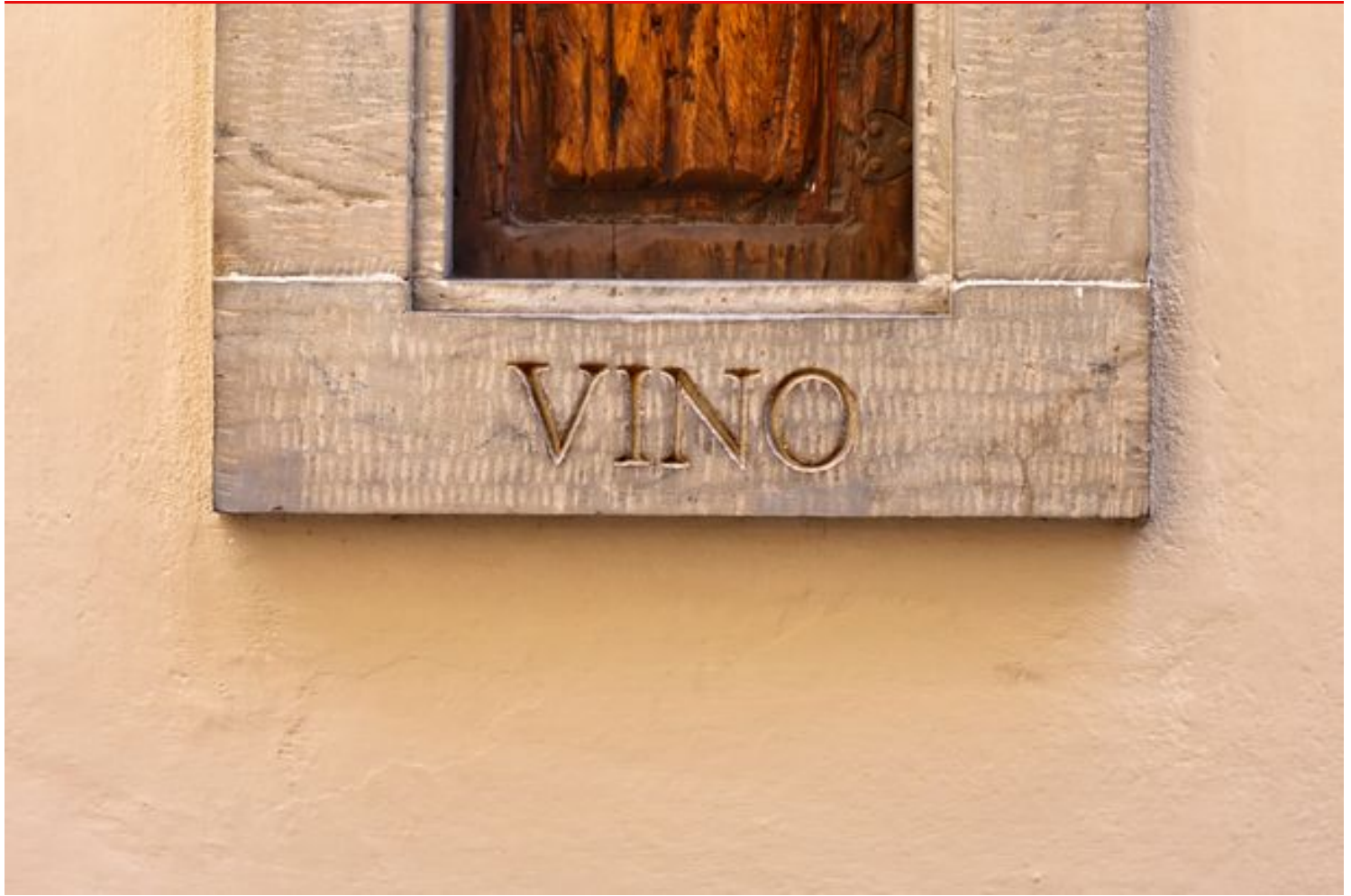
The windows date back to the 1600s

SHOP VOUCHER CODES OFFERS BINGO DATING JOBS FUNERAL NOTICES HOROSCOPES CARTOONS