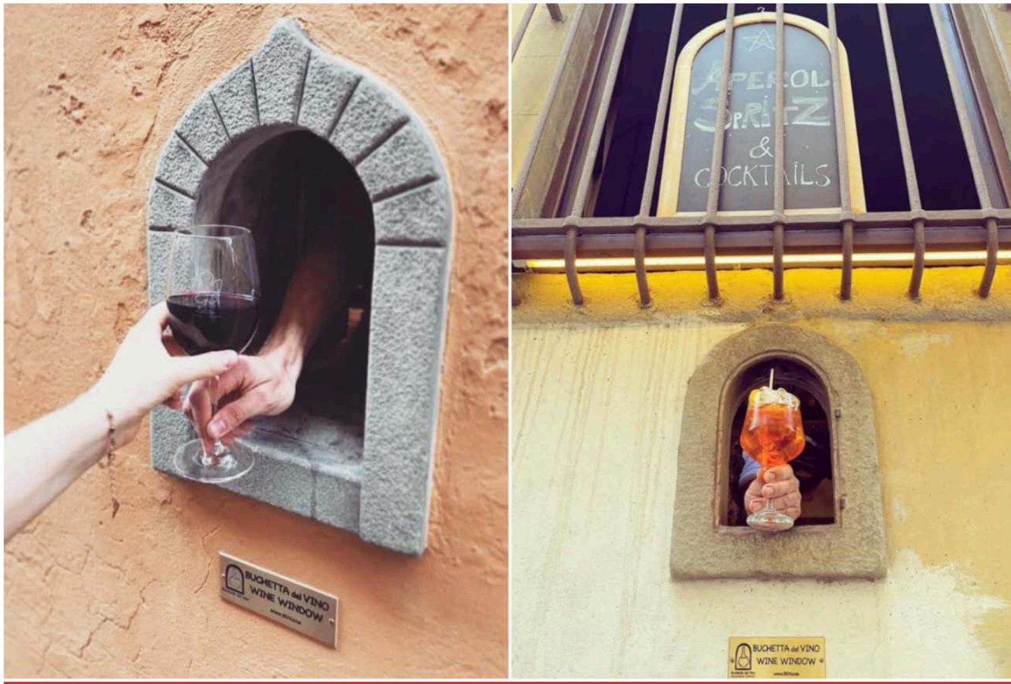
Buchette del Vino

It's a quaint tradition — with a very dark history.