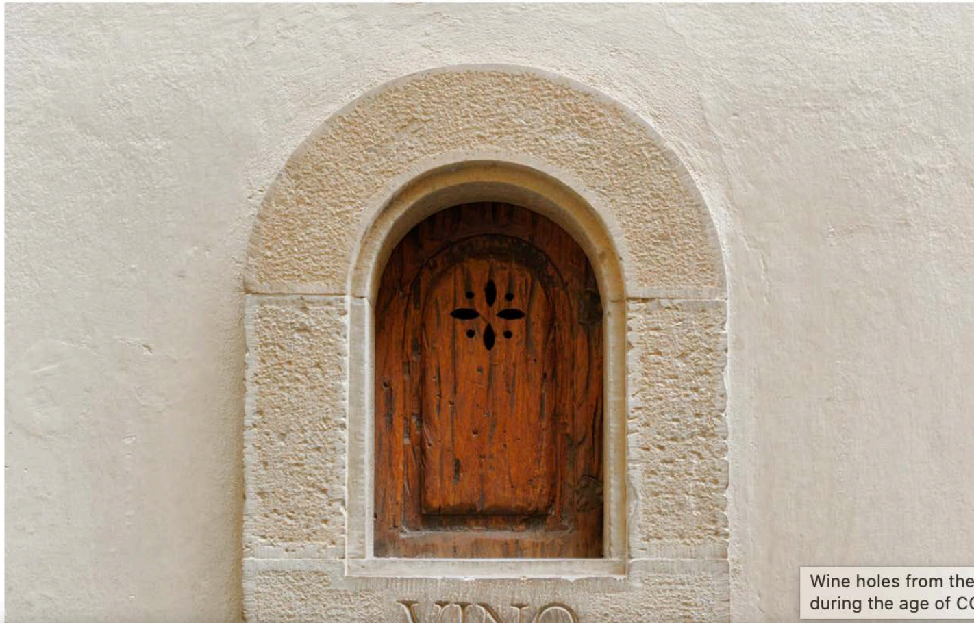
Wine holes from the Bul during the age of COVID

You will be astonished to know that the wine windows or buchette del vino are not a 21st century invention. These were originally in use during the 1400s in Italy. The working class was served surplus wine through these windows during the bubonic plague. From that pandemic to this, seems like this is a pandemic tradition that the country has been following. Back in the olden days, the customers would hand over their flasks through the window and get them filled with wine. Just like the COVID-19 pandemic, people would not hand money directly. The coins were also disinfected with vinegar.