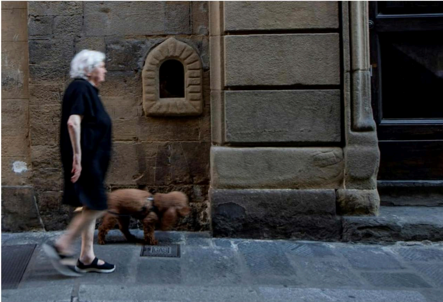
Many of the historical "buchette del vino" windows have been destroyed, especially in World War II

That could translate into big savings, for "at the time wine consumption was enormous," he said, with a grin.