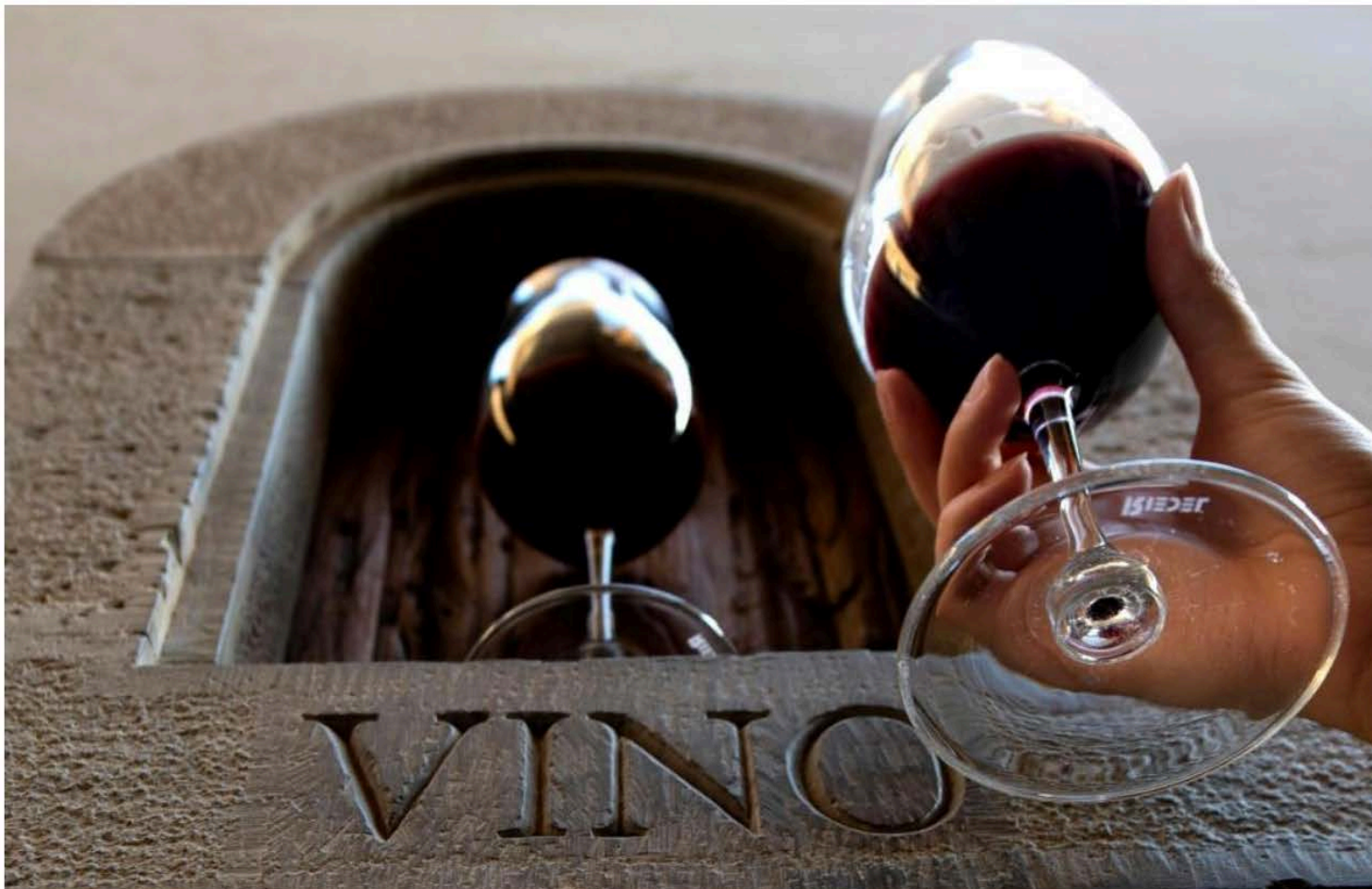
Small "wine windows" were created in 16th-century Florence for landowners and wealthy families to pass alcohol that they had produced directly to customers

The small "wine windows" can be seen dotted around the Tuscan capital next to the grand entrances of sumptuous noble palaces, where wealthy families used to sell alcohol directly to thirsty customers, passing flasks through to eager hands.