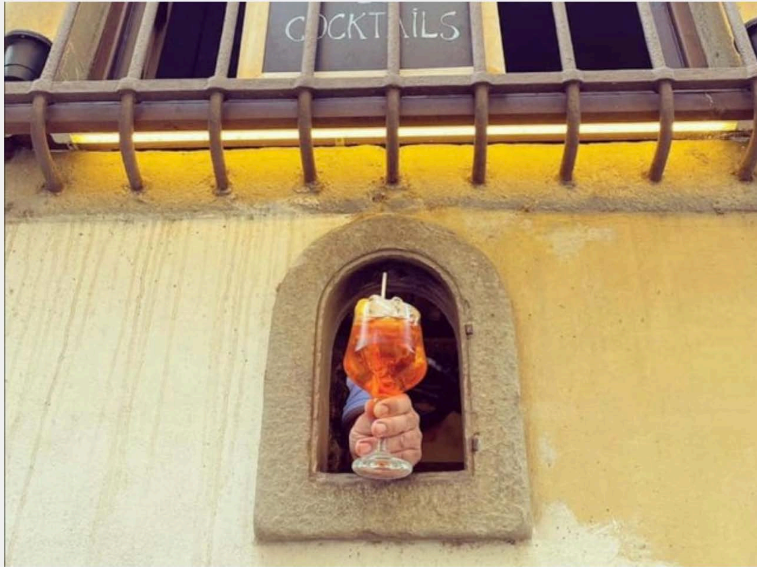
Down the hatch: An Aperol Spritz served through a wine window in Florence.