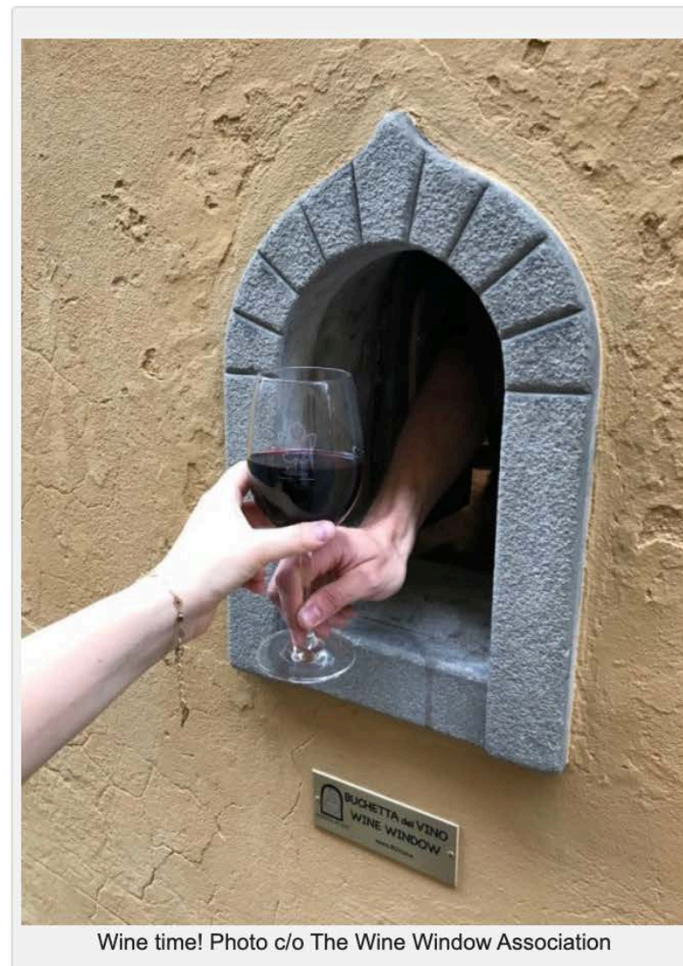
Wine time!

The windows, known as 'buchette del vino', are looked after by the Wine Window Association , which was created by three Florentines in 2015.